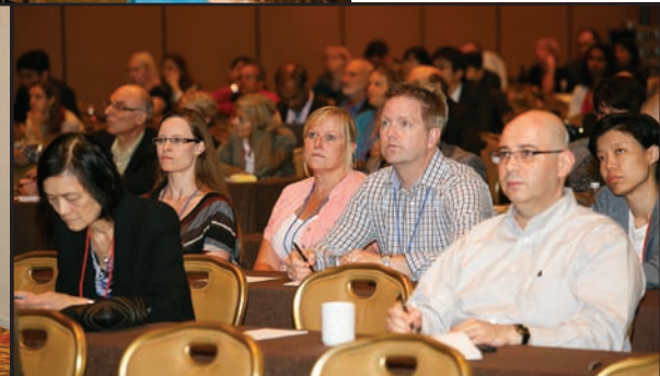
Participants learned about the latest basic science and clinical research in poster and oral sessions.