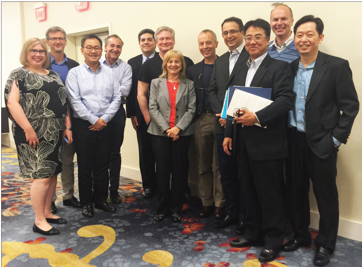
FNM 2016 Planning Meeting

more information • www.motilitysociety.org